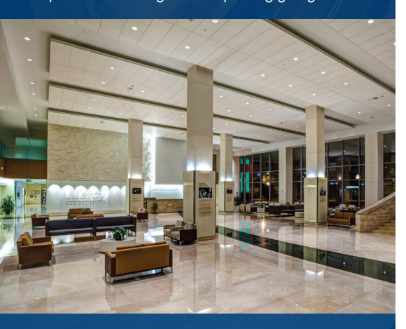
Energy-efficient lighting in the Bunting Center's lobby creates a warm and inviting atmosphere.