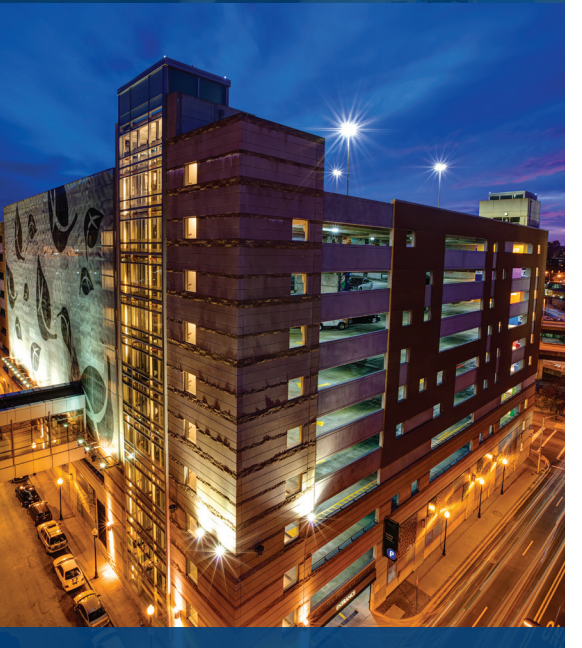
Retrofitting 460 metal halide fixtures with LED lighting reduced energy demand by 125 watts per fixture throughout the parking garage.